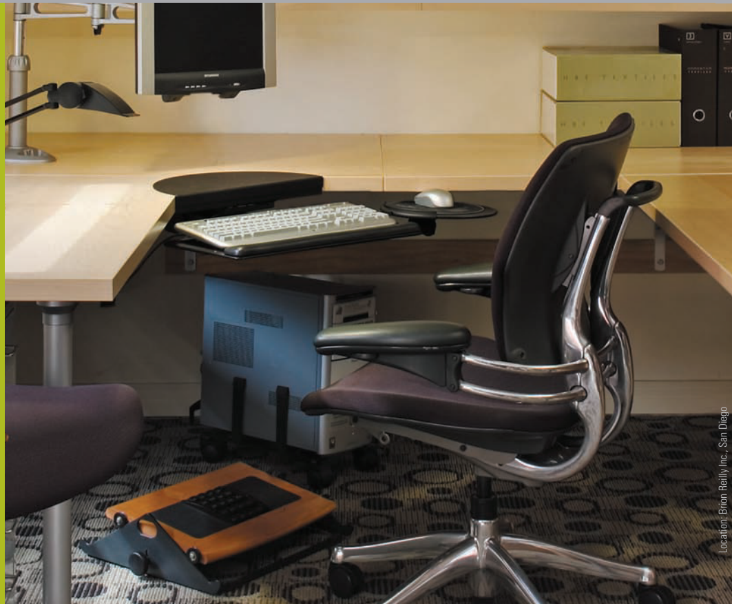
Location: Brian Reilly Inc., San Diego

A highly ergonomic work environment is built around four primary tools—task chair, articulating keyboard/mouse support, adjustable monitor arm and task light—that work together to improve the health and comfort of computer users. The absence of any one of these four tools may impact the ergonomic benefits of the others, whereas additional components, such as foot rests, can further improve the workstation's ergonomics. To better understand how the ergonomics leader can dramatically improve your workday with the right assessments, tools and training, contact your Humanscale representative.